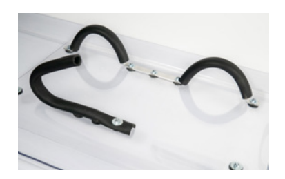
NOTE: POLICE or SHERIFF sticker (in desired language) can be added free of charge.